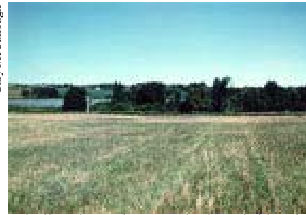
A buffer of trees between the farm field and marsh protects the wetland.

Some agricultural practices may negatively impact nearby wetlands. For example, poorly designed water crossings and over cultivation can enhance soil erosion. Eroded soils can increase turbidity in water, damage vegetation, cover fish spawning areas, and damage wildlife and waterfowl habitat.