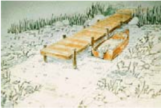
Carefully built docks avoid harming habitat.