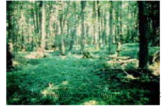
Some wetlands do not appear wet year-round.