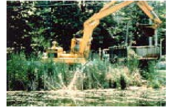
Dredging is not a favoured option, but does have some applications.