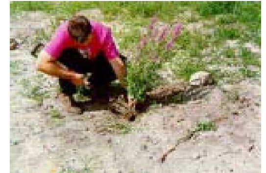
Removal of some aquatic plants may benefit wetlands.

Many wetland areas bordering lakes and streams are used for fishing and boating. Care should be taken to ensure that structures built for these activities do not harm fish and wildlife habitat. Docks and boathouses should be carefully planned, built and located. Solid foundations should be avoided since they impede the movement of fish, destroy aquatic plants, disturb underwater sediments, and destroy wildlife habitat including critical fish spawning areas. A work permit is required from the Ontario Ministry of Natural Resources for the construction of any solid structures in the water.