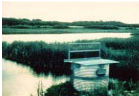
Water level control may benefit wetlands.

Presence of water throughout much of the year is the most critical factor in maintaining a wetland. Changes to water depth and length of wet or dry conditions may have profound effects on wetland function. Apart from destroying habitat, draining wetland areas lowers the water table, and can increase downstream erosion and flooding which can affect other landowners.