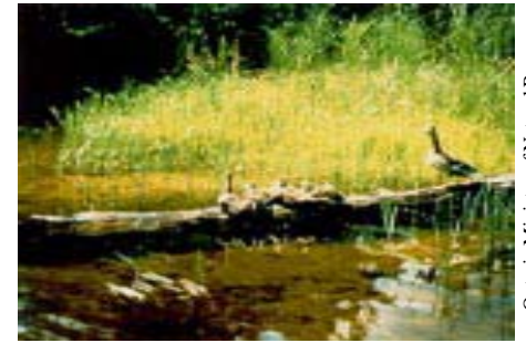
Many wildlife species use wetlands for habitat.