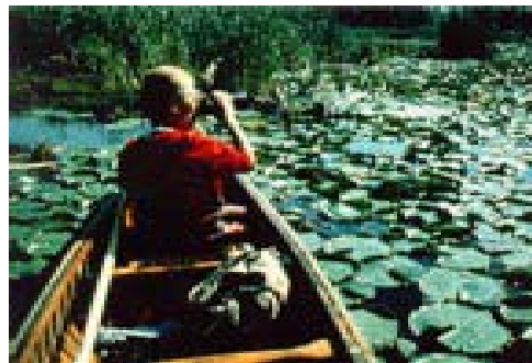
Wetlands provide a variety of benefits.